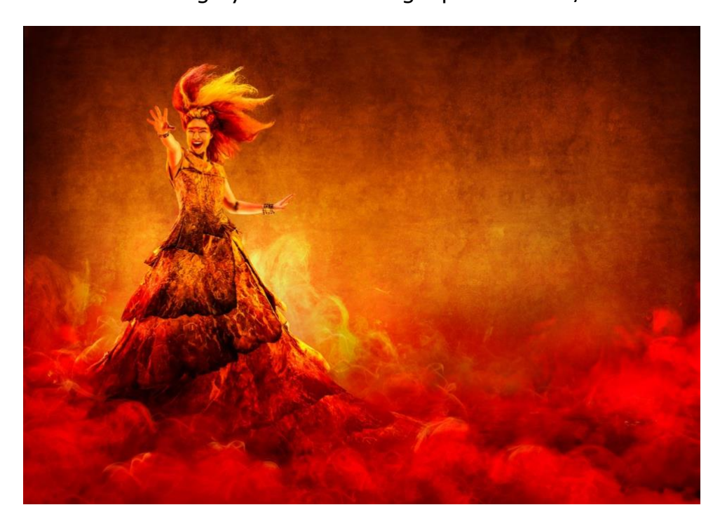
5 December 2021 – 9 January 2022 Wagner Götterdämmerung NEW PRODUCTION

Göteborg Opera House, Gothenburg, Sweden