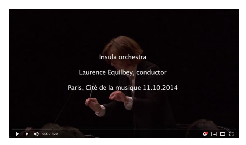
Watch Insula orchestra perform Weber's Battle Music from Kampf und Sieg

The programme culminates in Beethoven's 'Pastoral' Symphony no. 6, the composer's hymn of nature and peace. The project is performed in Dortmund to mark UN World Environment Day on 5 June 2020 , joining the Beethoven Pastoral Project encouraging orchestras around the world to engage with the environment through the 'Pastoral' Symphony.