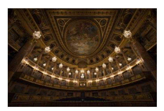
The Opéra Royal

The Opéra Royal mounts its first contemporary production on 4 December , presenting the French premiere of John Corigliano's The Ghosts of Versailles in a co-production with the Glimmerglass Festival. Corigliano's 1991 opera, written to mark the centenary of the Metropolitan Opera House, is set in the afterlife: at Louis XVI's court in Versailles. At its premiere it was hailed as 'a stunning success' by the New York Times.