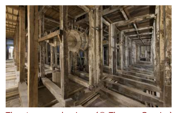
The stage mechanisms

Historic state visits continued to take place in the Opéra Royal after the French revolution, including a visit by Queen Victoria and Albert in 1855 and Queen 1957. Elizabeth IIin The building has since enjoyed a colourful history, with the Sénat convening there for three years from 1876.