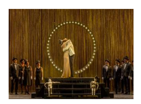
La Périchole