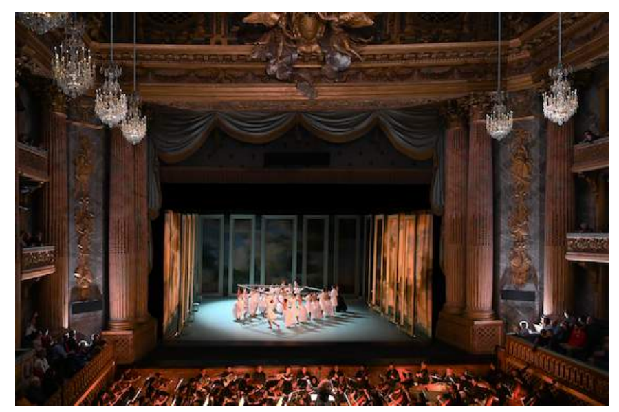
Marie-Antoinette Ballet

"The world is full of magnificent opera houses built to impress, but the Opéra Royal de Versailles may just trump the lot." Opera Now